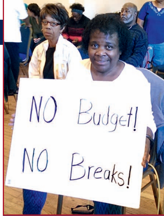
Neighbors participated in budget negotiations by holding Senate leadership accountable for producing a compromise during their recess in November.

Unfortunately, the budget that was later passed in both Houses and line-item vetoed by Governor Wolf is broken. It does not fully fund our schools, exacerbates the impending retirement crisis and is fiscally irresponsible, with an approximately $500 million deficit. That's why the Governor would not sign the budget as a whole, and instead only signed parts of the budget. Passing the rest of the 2015-16 budget will require further negotiations between state leadership, and even more citizen engagement. If your voice is not heard in Harrisburg, we cannot put an end to the impasse governing that has taken hold in Pennsylvania.