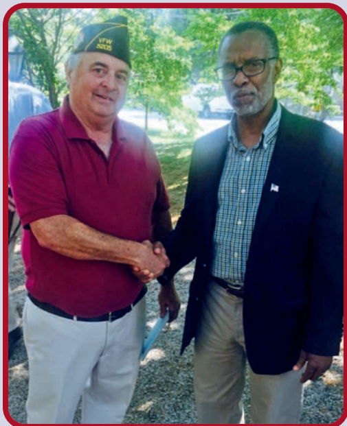
▲ VFW Post 5205 in Chestnut Hill honored those who gave the ultimate sacrifice on Memorial Day.