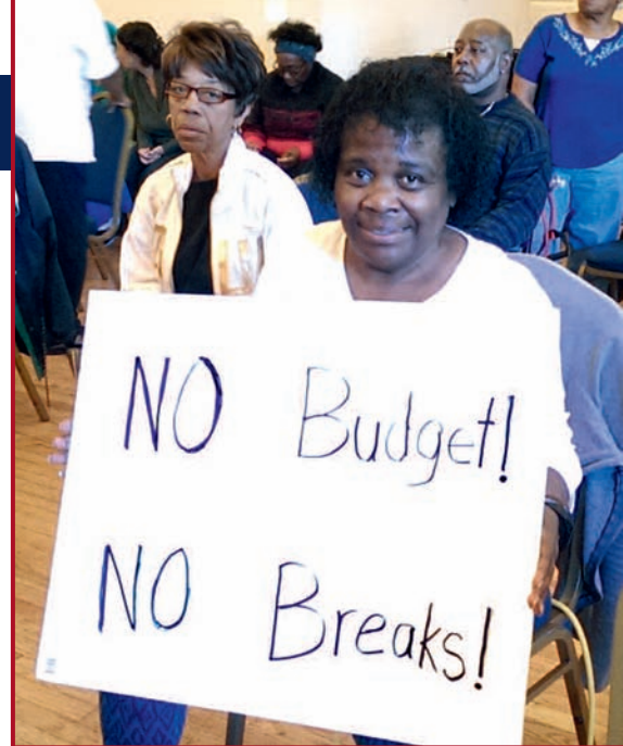
Neighbors participated in budget negotiations by holding Senate leadership accountable for producing a compromise during their recess in November.

Unfortunately, the 2015-16 budget that was later passed in both Houses and became law is broken in many ways. While it provided a partial funding boost to schools of $200 million, the 2015-16 budget failed to meaningfully restore education cuts and offered no sustainable solution to manage the state's $1 billion deficit. That's why the Governor would not sign it. Building a better budget to turn the state around will require more citizen engagement. If your voice is not heard in Harrisburg, we cannot put an end to the myopic priorities that have taken hold in Pennsylvania.