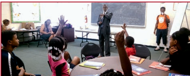
Reading Revolution Summer Camps are a partnership between my office, Mt Airy USA, the Free Library of Philadelphia, AARP Experience Corp, five Northwest Philadelphia Recreation Centers and generous community members.