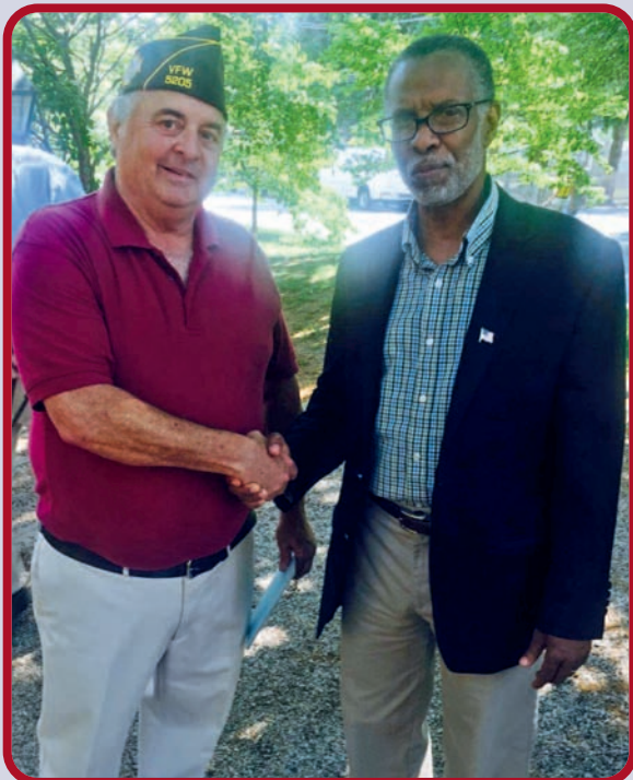
▲ VFW Post 5205 in Chestnut Hill honored those who gave the ultimate sacrifice on Memorial Day.