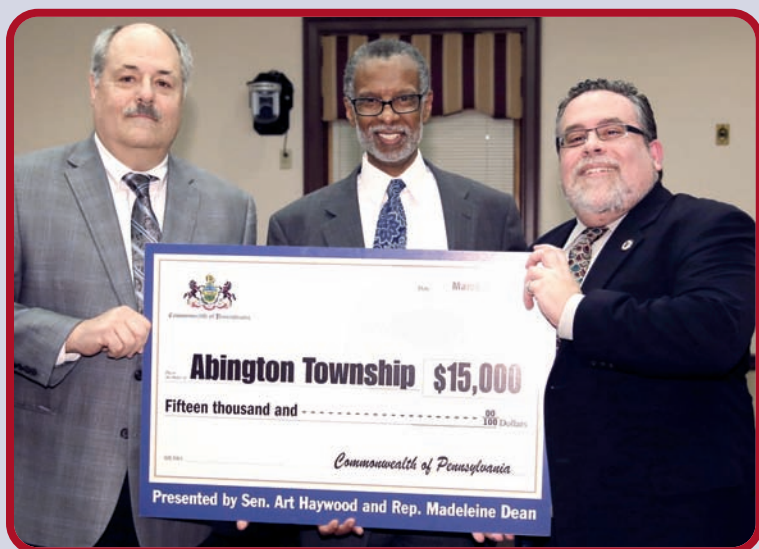
▲ I was glad to present Abington Township Parks & Recreation Department with a $15,000 Community Conservation Partnerships Program grant to make rehabilitation studies possible for Crestmont and Penbryn pools.