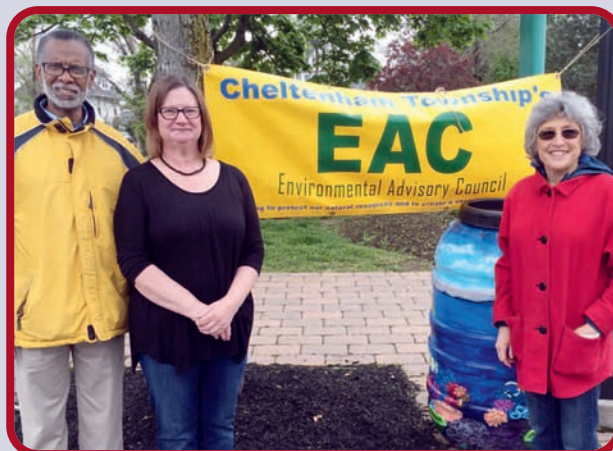
▲ I met with residents and Cheltenham Environmental Advisory Council leaders at the 2016 Glenside Arts Festival.