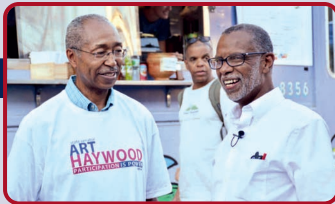
▲ The Mount Airy Street Fare brought thousands of community members to Germantown Avenue this past Fall.