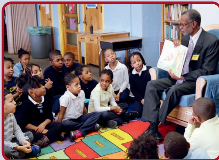
▲ On Read Across America Day, I read to children at schools and libraries across the 4th district.