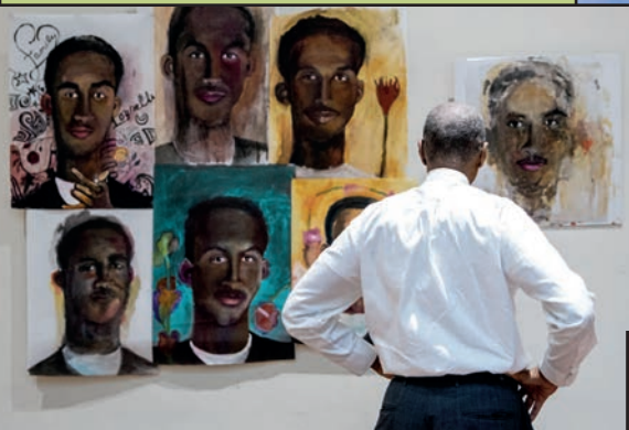
Senator Haywood viewed the artwork on display for Souls Shot: Portraits of Victims of Gun Violence at the Capitol Building in Harrisburg, August 2018.