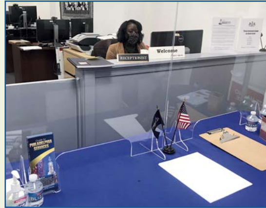
Mt. Airy District office opened for appointments while adhering to CDC guidelines.