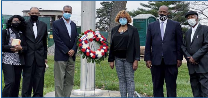
Senator Haywood attends wreath laying at a West Oak Lane cemetery on Veteran's Day.