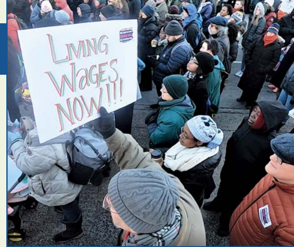
The McRaise the Wage rally was held in Germantown on Martin Luther King, Jr. Day, 2020 with over 300 supporters.