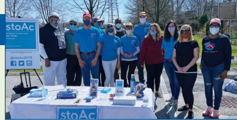
▲ Senator Haywood attends opioid overdose prevention event in Springfield in March.