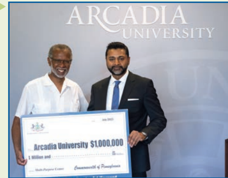
Senator Haywood presents a $1 million check to Arcadia University in Glenside in July.