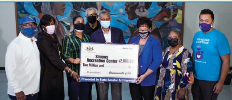
▼ Senator Haywood presents a $2 million check to Simon's Recreation Center in West Oak Lane in October.