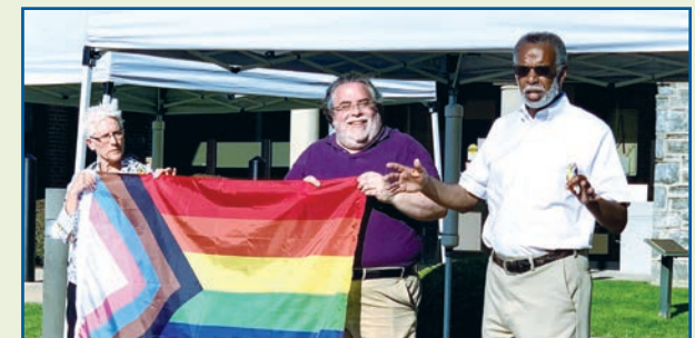
▲ Senator Haywood speaks at a Pride flag raising ceremony in Abington in June.