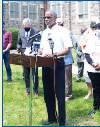
▲ Senator Haywood announces his gun violence bill at press conference in Germantown in May.