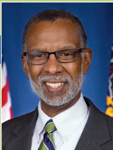
STATE SENATOR ART HAYWOOD